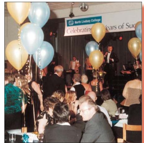
Celebrations in full swing at the Golden Jubilee ball

The college would like to thank all who attended the celebration evening and made the night such a success, and would like to say that it is already looking forward to the 100th birthday celebration, which will be in June 2053!