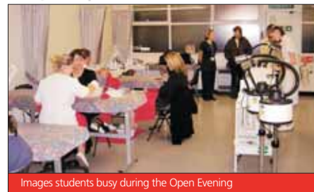
Images students busy during the Open Evening

The college would like to thank everyone who came along, and would invite you to look out for next year's event, which promises to be even better.