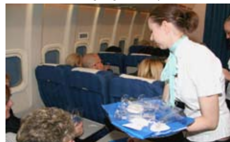
In-flight drinks being served