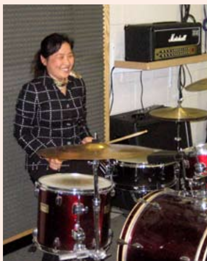
Visitor from the Dalian trying her hand at the drums in the College's recording studios

Before departing the visitors commented: "We found the College was very interesting, every corner had something new and exciting to see. The traditional English afternoon tea was very enjoyable, something we've heard of but never experienced before. We were touched by the welcome and warmth of the staff and students."