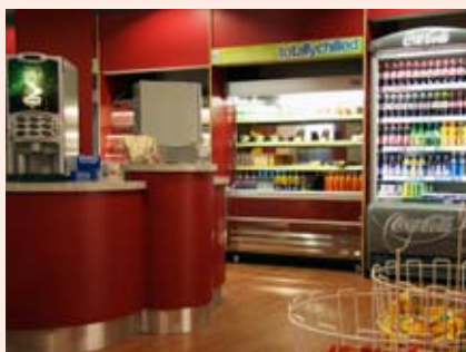
The new College shop

Inspiring Futures Transforming Lives Building Prosperity Delivering Success