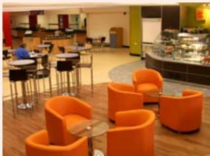
The new dining area

Aramark's vision is "to blend traditional home cooked meals with international flavoursome cuisine." The hot counter provides this nutrition and also offers salads and light snacks.