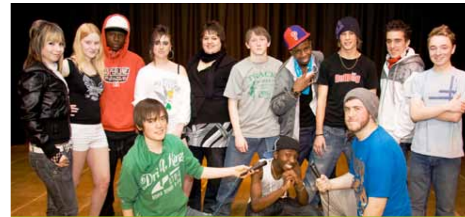
All the talent show finalists

Learners benefit from the competition as it raises their confidence levels whilst proving College life is about learning but also having fun.