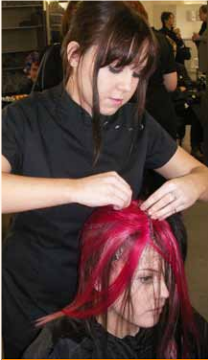
Hairdressing learner starting work on her model