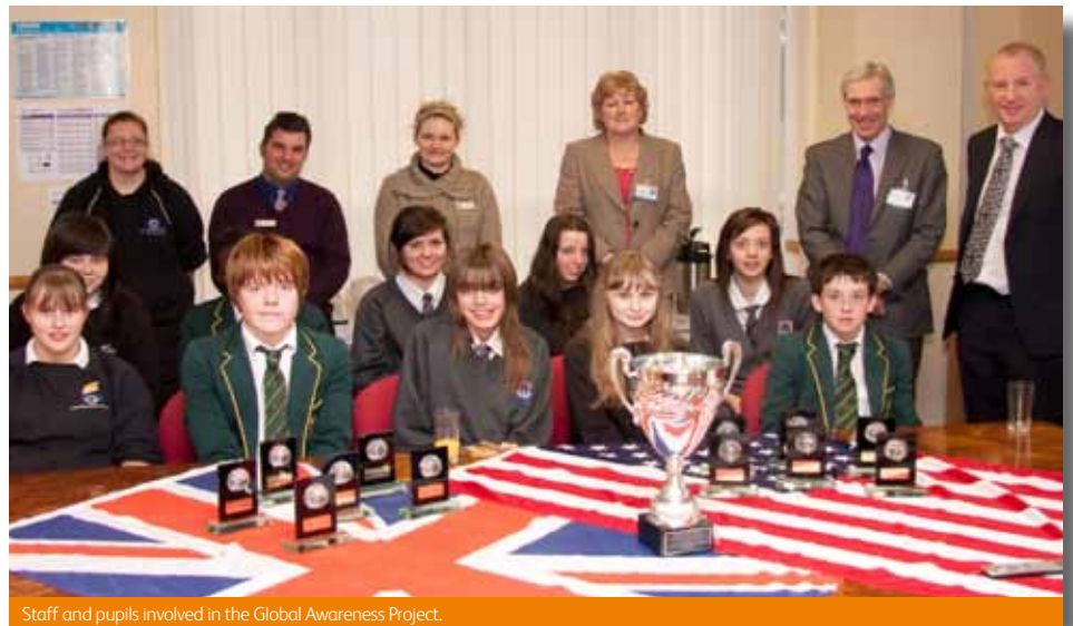
Staff and pupils involved in the Global Awareness Project.